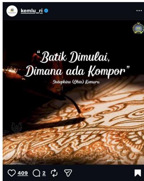
Gambar 2. National Batik Day Post (2021)