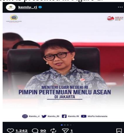
Gambar 1. Post on ASEAN Foreign Minister's Meeting

Sumber: https://www.instagram.com/kemlu_ri