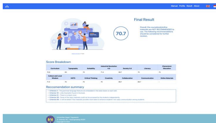
Figure 3. Evaluation Result of English for Change Coursebook (for grade XI)

Table 2 shows the content of Figure 2. It presents the evaluation results for the Work in Progress Coursebook for Grade X, yielding an overall score of 75.4. This indicates that the coursebook is recommended for use, with only a few minor improvements. The breakdown of scores is as follows: the curriculum scored 7/10, typography 6.75/10, suitability 7/10, and Industrial Revolution 4.0 scored 8/10. The Society 5.0 and character education received a score of 7/10. The culture and local wisdom section scored 6/10, and HOTS (higher-order thinking skills) was rated 8/10 (critical thinking, creativity, collaboration, and communication), with 7/10.