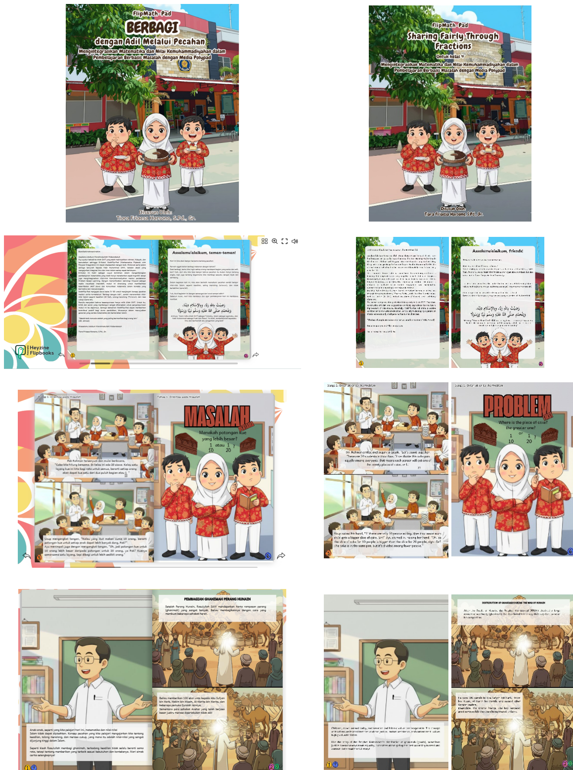
Figure 2. Overview of the mathflip-pad media

During the implementation stage, teachers were involved in pre-implementation activities to ensure a shared understanding of the learning flow, the use of MathFlip-Pad, and the integration of the Problem-Based Learning approach and Muhammadiyah values in the teaching tools used. This involvement was carried out through reviewing the teacher's guide, discussing activity scenarios, and aligning perceptions regarding the role of facilitators during the intervention.