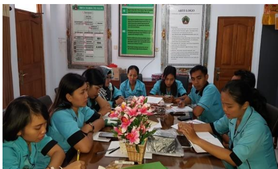
Figure 1. FGD Process Step One

curriculum maps based on study material (Regulation of the Minister of Research, Technology, and Higher Education No. 44 of 2015). Only two respondents named study program CPL that "produces care provider midwives and professional nurses in the field of HIV/AIDS".