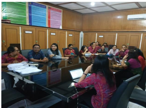
Figure 3. FGD Process Step Three