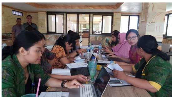
Figure 2. FGD Process Step Two

In this phase, FGD step two was carried out, illustrated in Figure 2. In addition, Table 3 shows that 90.6% of lecturers never reviewed the syllabus that had been prepared with the process of preparing incorrect syllabus to 53.1%. Nevertheless, most of the lecturers (84.4%) knew that the syllabus is the responsibility of lecturers, with minimal components that are suitable with the national standard of Higher Education as stated in the Regulation of the Minister of Research, Technology, and Higher Education No. 44 of 2015 (56.3%). This content standard includes criteria for a minimum level of depth and breadth of learning material (Regulation of the Minister of Research, Technology, and Higher Education No. 44 of 2015).