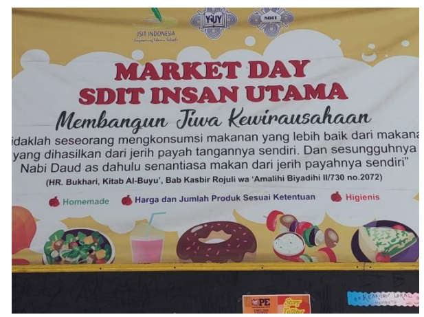
Figure 2. Poster "market day" at SDIT Insan Utama Bantul Yogyakarta

The reasons for using symbolic money are (1) simplifying the transaction process. Sometimes students are given one full sheet of Rp 5000,00 by their parents, and the seller does not have change so that it slows down the buying and selling process of other students (2) making it easier to calculate purchases and sales (3) anticipating students losing their real money. The symbolic money model is also one of the child-friendly services from SD IT Insan Utama because it protects children's psychology by reducing the psychological burden of keeping real money without compromising the essence of entrepreneurship learning. Child-friendly services are one of the recommendations of Saptono's (2022) research, which states that school administrators must implement child-friendly policies in learning in schools.