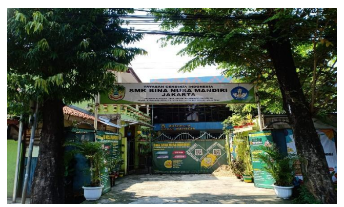
Figure 2. School of SMK Bina Nusa Mandiri Jakarta.

Researchers conducted observations and interviews at SMK Bina Nusa Mandiri Jakarta, located on Jl. Penganten Ali No.4, Rt.01 Rw.06, Ciracas, East Jakarta. Observations were made by observing teachers in making learning media. This observation was made to find out how teachers make learning media. Interviews were conducted by collecting information related to learning media teachers use during learning. The results of observations and interviews at SMK Bina Nusa Mandiri show that eight teachers have used the Canva Application on the bell jar. Id and some teachers still have not used the Canva Application on the Belajar.id website, as shown in Figure 2.