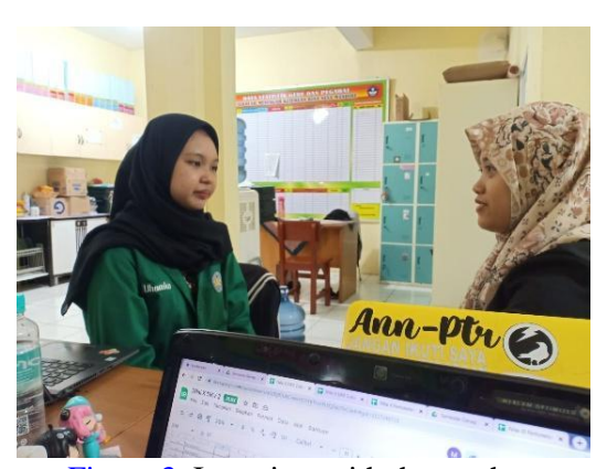
Figure 3. Interview with the teacher.

The results of interviews conducted by teachers at SMK Bina Nusa Mandiri Jakarta show in Figure 3 who have used the Canva Pendidikan Application said that many benefits are felt when using the Canva Pendidikan Application because this application for people who do not understand the world of design is beneficial because of its accessible features, the templates provided vary so that this provides convenience for teachers.