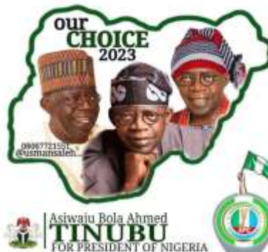
Figure 6. Campaign poster of Bola Ahmed Tinubu with Cultural Identity

Images of cultural identity indicate people's way of life. The poster under consideration highlights identities of the three main tribes in Nigeria namely Hausa, Yoruba and Igbo. These cultural identities are reflected on the three hats worn by the APC candidate in the poster.