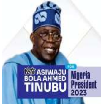
Figure 2. Campaign poster of Bola Ahmed Tinubu with Lexical Images

Indexical images are recognisable, not because of their similarities to objects or persons, but because we understand the relations between them and the concepts that they stand for. They are usually accompanied with texts to avoid being confused for some other types of images or signs.