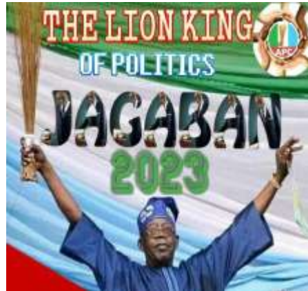
Figure 4. Campaign poster of Bola Ahmed Tinubu with Images of Metaphor