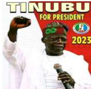
Figure 5. Campaign poster of Bola Ahmed Tinubu with Images of Colour Connotations