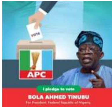
Figure 3. Campaign poster of Bola Ahmed Tinubu with Iconic Images

Iconic images bear similarity or semblance to what people already know or what we conceive about an object or person. Iconic images usually include maps, photographs and paintings.