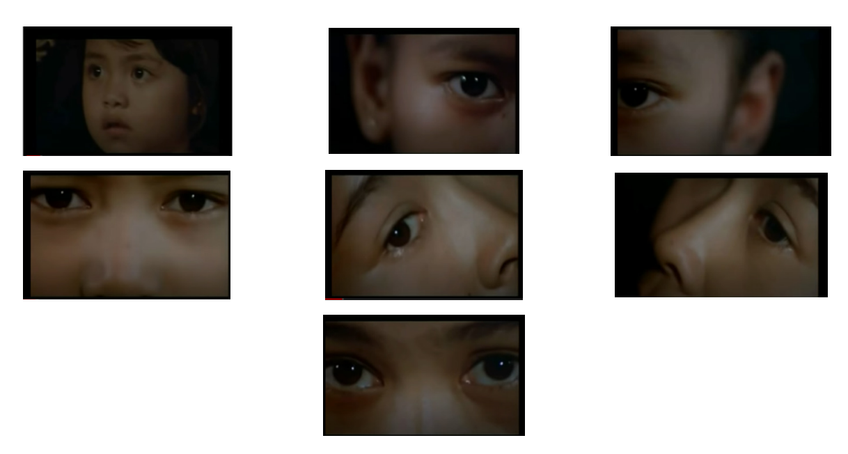
Figure 1. The close-up shots on eyes symbolize Kartini's characters of observant, curious and critical (Sjumandjaja, 1982).

expressing thought and feeling- as in Shakespeare play "green-eyed jealousy", and symbol of intelligence- as in Plato' Republic "the eye of the soul" (Ferber, 2007). In this film, Kartini's eyes symbolize her thought and feeling to what she sees happening in her environment. The eyes are linked to Kartini's curiosity and restlessness on the poor condition of the people and her own life as a Javanese noble woman. It also reflects her emotion and agitation and leads to her action to protest the tradition that limits her freedom.