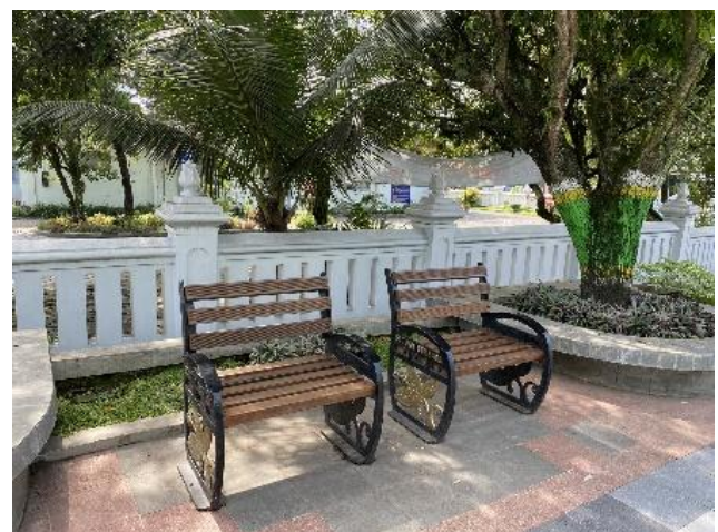
Figure 3. Seat facilities for pedestrians on Parasamya Street

are made with dimensions as needed and use materials with high durability.