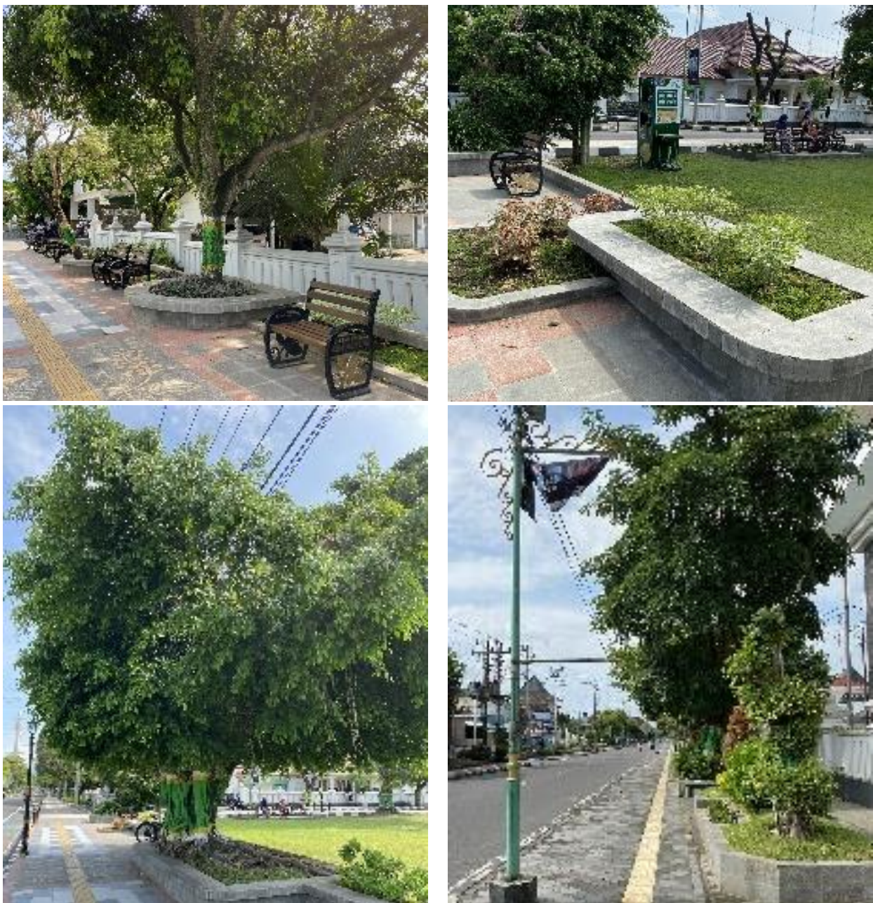
Figure 8. Vegetation on Parasamya street corridor

The next step after identifying the walkability component is scoring. Each component is assigned a score in the 1-3 based on availability and performance. The scoring is displayed in Table 5 .