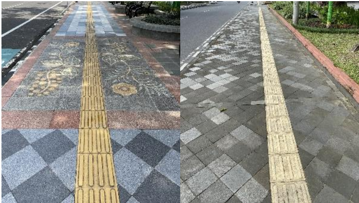
Figure 2. Pedestrian path condition on Parasamya Street