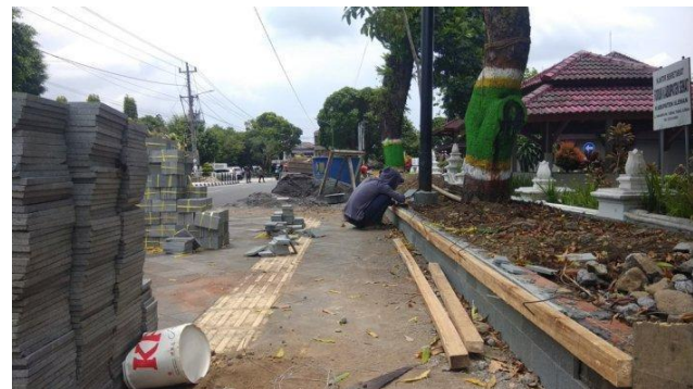
Figure 7. Revitalization of the west side of the Parasamya Street pedestrian path [19]

The pedestrian path arrangement is carried out in stages. The east side pedestrian path has already been arranged. Following the arrangement of the west side, it will be carried out in 2021. The budget for the pedestrian path on the west side comes from the Revised Regional Budget of 190 million rupiahs (see Figure 7 ).