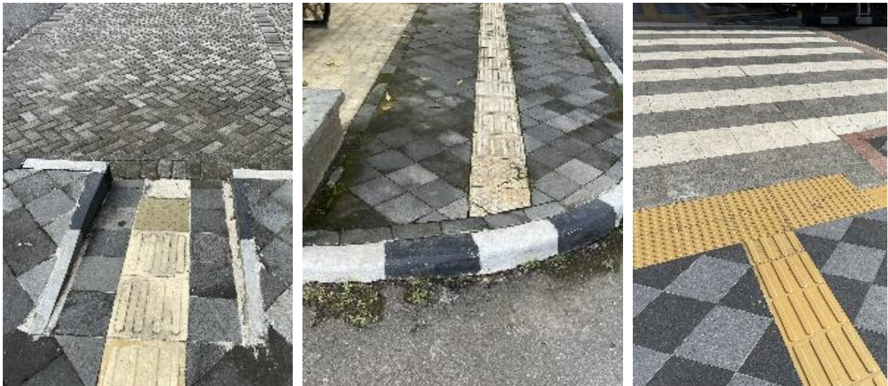
Figure 6. Facilities for the disabled on the pedestrian path of Parasamya Street

The ramp is an inclined plane that distinguishes the height of the floor surface and can facilitate movement, including on pedestrian paths. In the existing condition on Parasamya Street, ramps have been found at several main points on the east side around the government square. The condition of the ramp is very good, with a sufficient slope. However, there are still many other points of pedestrian paths on Parasamya Street that are not equipped with ramps, making it quite difficult for users with special needs, such as wheelchairs, to access the pedestrian path.