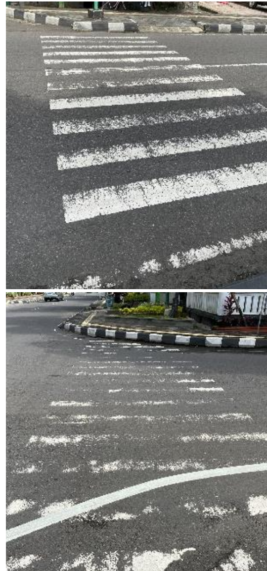
Figure 5. Crossing facilities on the Parasamya street corridor

People usually use the Zebra cross to cross from the east to the west and vice versa. Considering that this is a government area, there is also high mobility of pedestrian moving from one office building to another, so the availability of crossing facilities is certainly needed in this area. The zebra cross can be upgraded to a pelican crossing by adding a traffic signal and button for pedestrians to increase their safety.