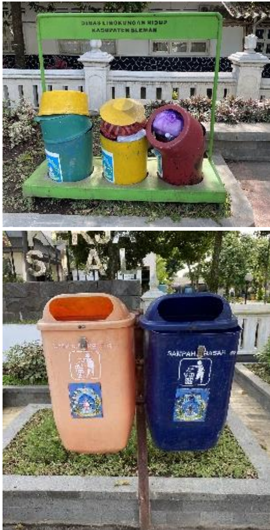
Figure 4. Trash bins on the pedestrian path of Parasamya Street