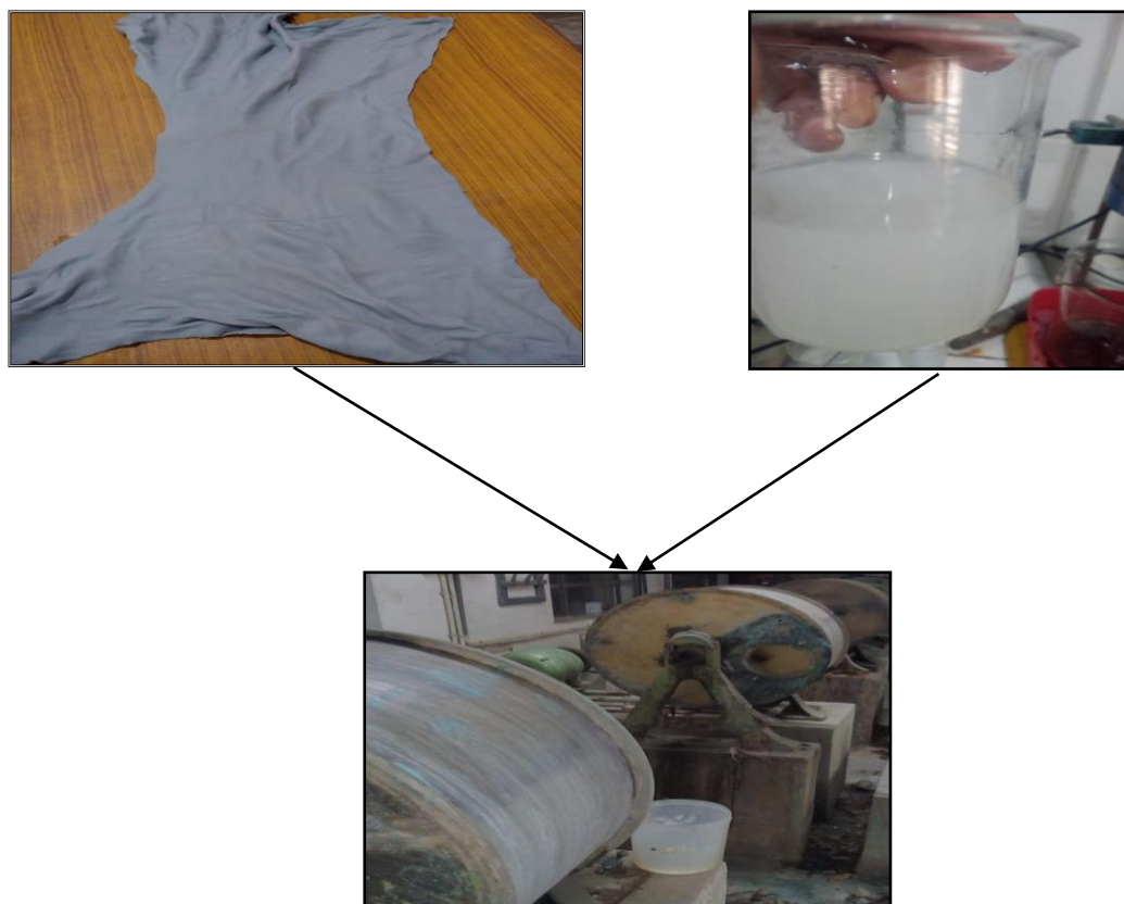
Figure 2. the Procedure of Leather Processing

Application of Fatliquor on two samples of Wet Blue Leather, one is goat skin and the other one is sheep skin. The process was carried out in 6.0% hemp fatliquor to result the fatliquored leather, as shown in Figure 2.