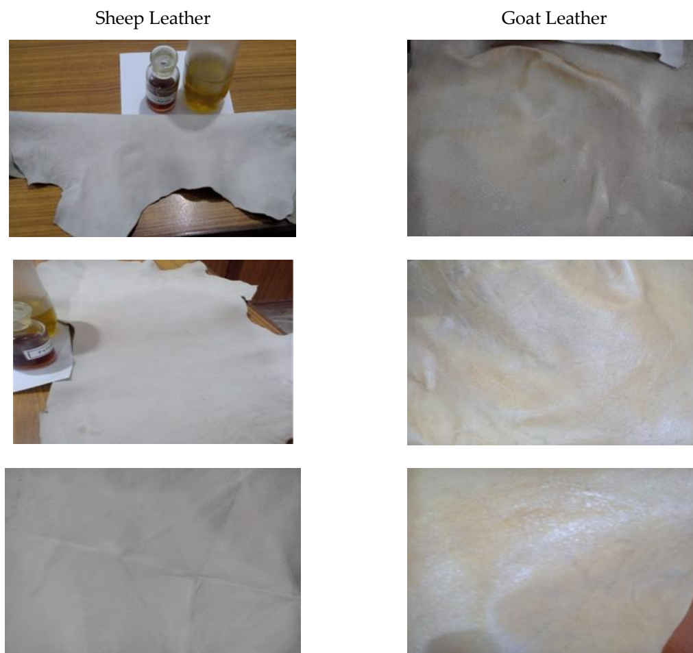
Figure 3. Natural Leather obtained after Application on Sheep and Goat Wet Blue