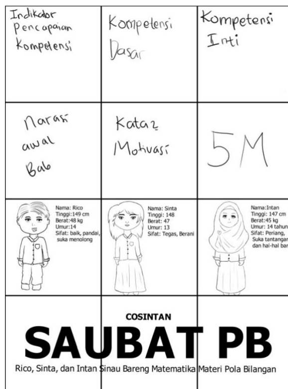
Figure 5. Instagram feed layout sketch

After developing the materials, story concepts, names, characters, and characters in the comics you have made, the next step was to create a storyboard, draw sketch to convey ideas. The results of the storyboard can be seen in Figure 4 . Sketching the layout of the contents of the Instagram feed aims to create the neat posts ( Figure 5 ).