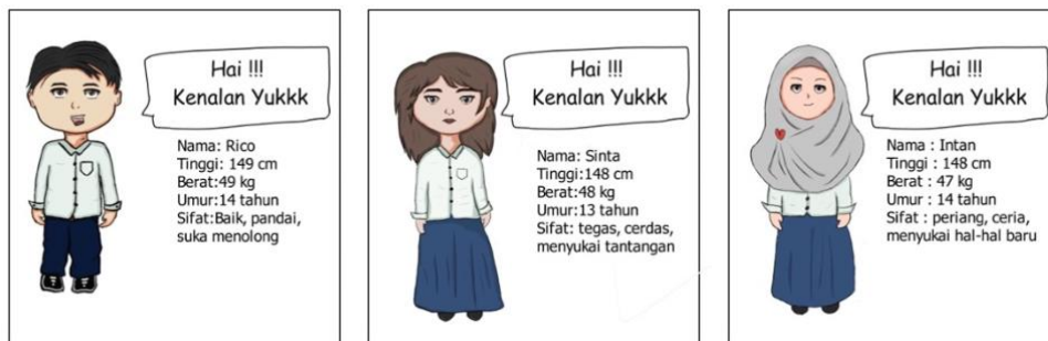
Figure 2. Designs for the names and characters of Rico, Sinta, and Intan

After that, the researcher developed comic story scripts along with examples of problems related to local culture (culture in Java). At this stage, the researcher developed the concept of the story along with examples of problems on paper first. The comic stories were made with the local culture theme in Java, namely about Plumpungan Salatiga Batik, Lurik Traditional Clothes, and the Tumpengan Tradition which were limited to designs, stories, and examples of questions. The design for the story concept that would be made in comics can be seen in Figure 3.