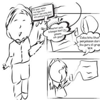
Figure 4. Storyboard