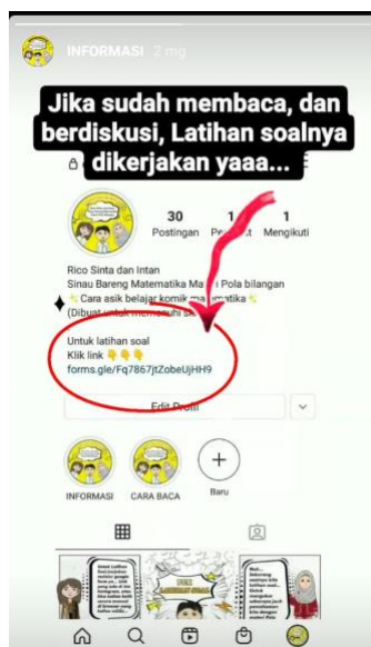
Figure 10. Google form link in Instagram Bio

Implementation Stage. At this stage, a validation test was carried out by media expert, material expert, math teacher, and a limited tryout on 27 Class VIII A students who had an Instagram account. The validation of media experts and material experts was carried out on September 7, 2021. The media expert in this study was one of the lecturers in Mathematics Education at UIN Salatiga. The results of the media validation were categorized as "Good" with a total score of 61 out of a maximum score of 75; then, the average of the total score was 4.07. The comments and suggestions provided by the media expert can become the basis for the revision.