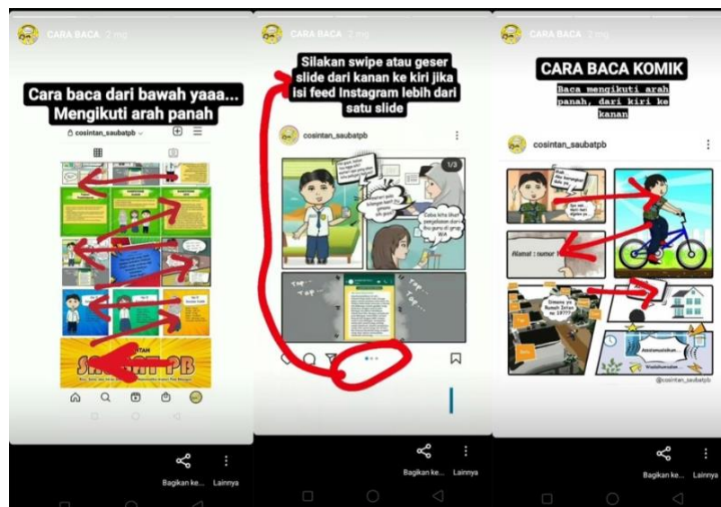
Figure 9. Procedures for reading comics through Instagram

The instructions for use and how to read are in the Instagram story highlights. How to read the media use starts from the bottom of the Instagram feed in a zigzag pattern from right to left, then going up, or by scrolling from bottom to top (Figure 8). Each Instagram feed contains a maximum of 10 slides. How to read comics is the same as reading books in general, namely from left to right, and then down (Figure 9).