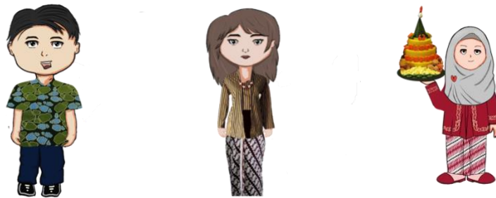
Figure 3. Plumpungan Salatiga Batik clothing design for Rico, Sinta and Intan characters

After that, the researcher developed comic story scripts along with examples of problems related to local culture (culture in Java). At this stage, the researcher developed the concept of the story along with examples of problems on paper first. The comic stories were made with the local culture theme in Java, namely about Plumpungan Salatiga Batik, Lurik Traditional Clothes, and the Tumpengan Tradition which were limited to designs, stories, and examples of questions. The design for the story concept that would be made in comics can be seen in Figure 3.