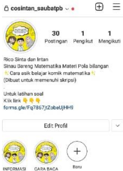
Figure 7. Interface of Bio Instagram