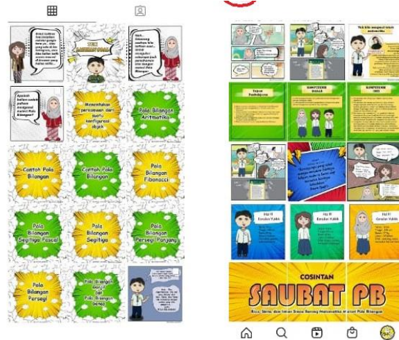
Figure 8. Interface of Instagram feed layout

The instructions for use and how to read are in the Instagram story highlights. How to read the media use starts from the bottom of the Instagram feed in a zigzag pattern from right to left, then going up, or by scrolling from bottom to top (Figure 8). Each Instagram feed contains a maximum of 10 slides. How to read comics is the same as reading books in general, namely from left to right, and then down (Figure 9).