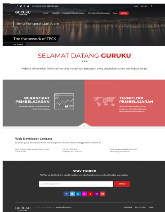
Figure 1. Homepage of the TPACK Website

The results of product validation carried out through assessments of the website media and material experts for the TPACK instruments are shown in the Tables 10 and 11, respectively. The TPACK instrument validation results show that the aspects of TK, PK, and CK of the instruments are very feasible to be used. Moreover, the website validation results show that the TPACK website is also feasible.