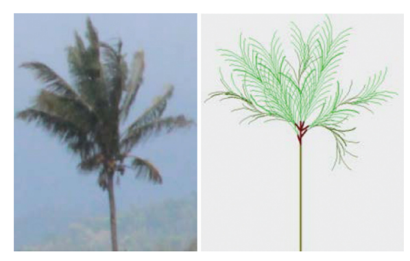
Figure 5. Figure of coconut trees and formation result of Lindenmayer system.