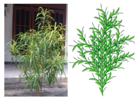
Figure 4. Figure of Lavender tree and the result form of Lindenmayer system.