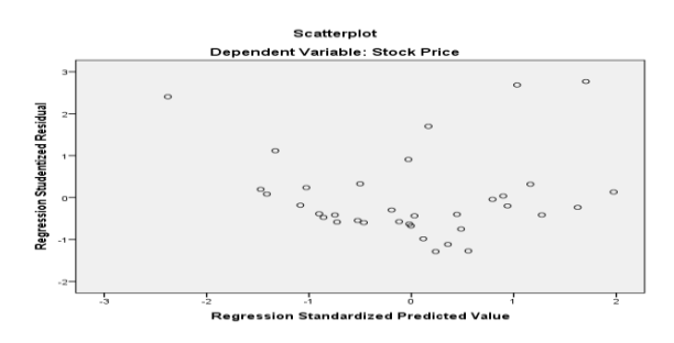
Figure 2: Heteroscedasticity Test

Based on the test results on figure 2 obtained images that have points that have unclear patterns and these points are below and above the number 0, it can be concluded that the multiple linear regression analysis in this study is free from symptoms of heteroscedasticity.