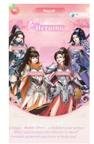
Figure 2. The Heroine/Female General

In the case of Female Generals in LoP , four of them are labeled as Partner who assist the player or main character in fighting enemies and completing quests. They also wear armor and carry weapons (Figure 2). The way the characters are illustrated makes the Female Generals look rather 'manly.' Being generals on their own, these characters can also be considered to harbor masculine traits despite being female. Generally, in otome games, male characters play the role of hero or potential love interest to their female counterparts. Their role as the dominant one does not derive far from the usual gender stereotypes even in the world of video games. In LoP , male characters are regulated mostly to the role of Confidant and Partner (Figure 3-5). Some of them may look manly by wearing armor or holding a sword (Figure 3); yet others may not look very manly as they are simply carrying a brush or teacup and dressed in lavish clothes (Figure 3 and 4). This brings to question what masculinity actually is and whether the quality of being masculine only belongs to men or not. Can women actually also be considered as masculine?