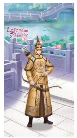
Figure 14. Duke Jing

Physically speaking, the Female General characters are shown to be a young female with long hair and slim figure. They are illustrated as a group of attractive females wearing armor and carrying a weapon, although their armor is vastly different from their male counterparts in the game as well as the ancient Chinese armor (Adams et al., 2003; Dien, 1981; Ding, 2005; Garrett, 2007). Duke Jing (Figure 14) and Prince Liang (Figure 15), male characters from the special recruitment option in LoP , are also shown wearing armor in their character illustrations. The armor they use is called brigandines, which was commonly used during the Qing dynasty (Adams et al., 2003; Garrett, 2007; Lai & Su, 2017). The full-body armor covers its user from head to toe and protects him from attacks.