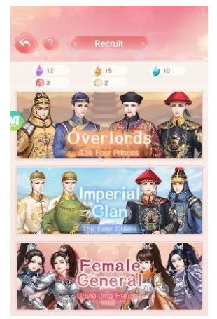
Figure 1. Recruitment Option

There are more than 40 partners available through various methods of recruitment in LoP . Among the large number of partners who can be recruited (Figure 1) in Legend of the Phoenix , there is a particular group known as the Heroine or the Female General through special recruitment (Figure 2). Qin Liangyu, whose quote is mentioned above, is actually one of the Female Generals that players can get through collecting specific recruitment tokens. In addition to Qin Liangyu, there are also three other characters in the category namely Hua Mulan, Mu Guiying, and Liang Hongyu. In total, there are four Female Generals that players can obtain from ranking and other major events in the game.