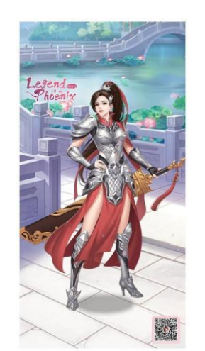
Figure 16. Hua Mulan's appearance

In games, female characters are often hypersexualized and associated with sexiness (Behm-Morawitz & Mastro, 2009; Burgess et al., 2007; Dill & Thill, 2007; Fisher, 2015). They are usually scantily clad or shown wearing revealing clothes that show their body shape and emphasize sexiness. Unlike Duke Jing and Prince Liang who wear full-body armor, Female General's armor seems to leave many areas uncovered. Their armor is pretty tight and form-fitting as shown below (Figure 16-19).