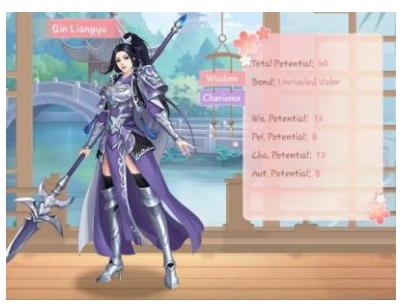
Figure 12. Qin Liangyu

On separate occasions in LoP , each General has made a statement regarding their skills with the chosen weapon. Mu Guiying explains that her sword can take on millions in addition to being able to drive away the "foreign clowns." Liang Hongyu also shows how she used her "trusty bow" to defend her country. All of these imply that the Female General can fight, using martial arts with or without a weapon.