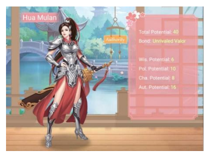
Figure 9. Hua Mulan

First, weapon mastery and martial arts, each Heroine is shown to be holding a specific type of weapon in their character illustration. Hua Mulan is holding a large broadsword resembling a buster sword (Figure 9). Then, Mu Guiying looks battle ready with her dagger (Figure 10), Liang Hongyu with her bow (Figure 11), and Qin Liangyu with her spear (Figure 12).