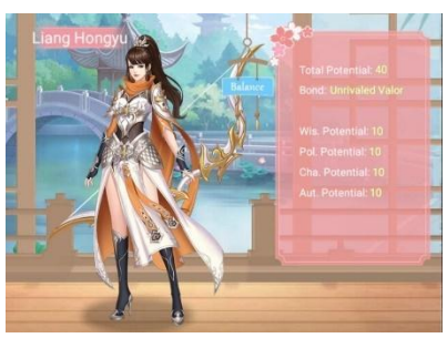
Figure. 11 Liang Hongyu