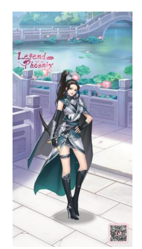
Figure 17. Mu Guiying's appearance