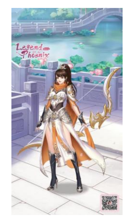
Figure 18. Liang Hongyu's appearance