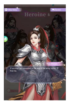
Figure 13. Hua Mulan's dialogue

Lastly, a general must possess knowledge about warfare and military. In LoP , Hua Mulan has said to the player (Figure 13), "If you ever get interested in the way of the army, come find me."