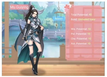
Figure 10. Mu Guiying