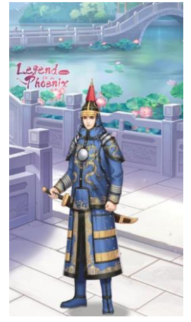
Figure 15. Prince Lian

In games, female characters are often hypersexualized and associated with sexiness (Behm-Morawitz & Mastro, 2009; Burgess et al., 2007; Dill & Thill, 2007; Fisher, 2015). They are usually scantily clad or shown wearing revealing clothes that show their body shape and emphasize sexiness. Unlike Duke Jing and Prince Liang who wear full-body armor, Female General's armor seems to leave many areas uncovered. Their armor is pretty tight and form-fitting as shown below (Figure 16-19).