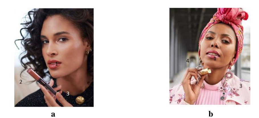
Figure 4. The Representation of professional woman