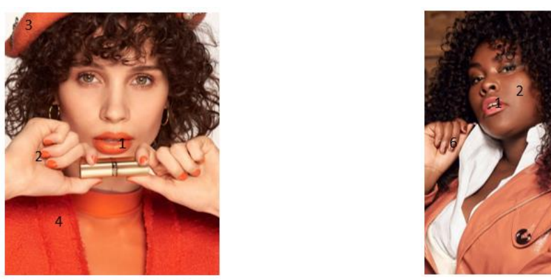
Figure 1. The gesture of the models

In this data, the researcher found a western posture which can be shown in Figure 1. The gesture is indicated by the hand holding the product and staring confidently. The gesture can be interpreted as a take action gesture. This gesture occurs because the character is about to take an action, as indicated by slightly raised eyebrows with a serious face that only focuses on an object that indicates readiness or seriousness (Feng & O'Halloran, 2012). The gesture is indicated by the head turned to one side, the eyes turned forward to look at the implied target of seduction, and the hand slightly lifting the collar.