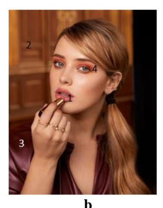
Figure 6. The object of beauty representation on women