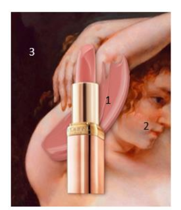
Figure 2a. The painting icon of visual sign

Peirce argued that there are three types of icon: an image, a diagram and a metaphor (Plowright, 2016). First, a piece of painting by Gustave Courbet from 1868 that now resides in the Metropolitan Museum of Art in New York was chosen as the background for a poster to promote lipstick products. This piece of painting is the painting "The Woman in the Waves". The picture is notable for its realistic flesh tones and traces of underarm hair. Statue characters are used to complete the poster image because the stone statues are carefully carved to form a beautiful work. The important idea about a metaphor, it is not to be understood literally (Plowright, 2016) In this data, researcher found 31 indexes in the form of posters. According to Pierce (Chandler, 2017), indexical is included direct connection, natural signs, medical symptoms, measuring instrument, signals, pointers, recordings, and personal trademarks. Poster is included in indexical recordings.