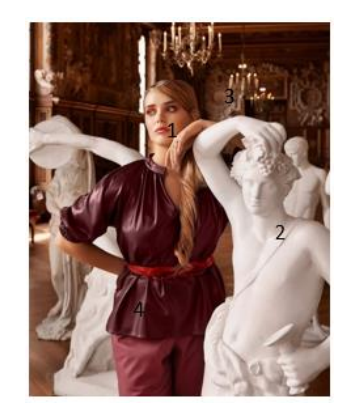
Figure 2b. The statue icon of visual sign