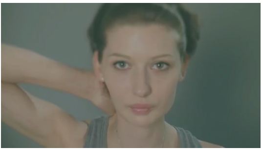
Picture 10 and 11. A woman looking down to her hole scar on her neck then looking straight to the camera

ideals have affected people in all gender as well, and from the music video, she wants to define a new definition of beauty which is not only quality a women can have, but beauty is about all the human beings and there is no gender limitation when it comes to the term beauty.