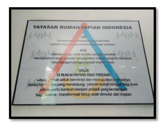
Figure 3. Vision and Mission of the Dream House Foundation.

supportive community - the road is not a good place for children; (2) children need to grow into individuals who have an impact on others - the transformation of children's lives begins with dreams.