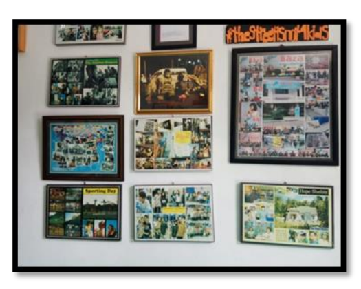
Figure 2. Documentation of the Activities of the Rumah Impian Foundation

in Indonesia. The children at risk are categorized as follows: (1) Children who cannot reach their dreams or be kept away from their dreams; (2) children living on the streets aged 0-15 years; (3) children with marginal or low income; (4) children in accordance with the age range determined by the child convention which is 0-17 years old; and (5) children whose communities and families face the law.