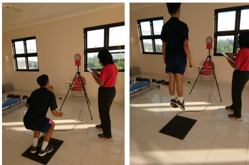
Figure 1. Vertical Jump Test Protocol

Meanwhile, the instrument used to measure agility is the agility t-test. The test protocol (see Figure 2) is in accordance with Semenick's recommendations (Čaušević et al., 2021), namely that each testee gets 2 opportunities with a rest break of 3 minutes. The testee stands behind the start sensor line, then sprints towards cone B. Next, towards cone C, reach using the left hand. Then, towards cone D, reach with your right hand. Return to cone B, touch cone B, then run backwards to the starting position (past the sensor). Best time to use. The pre-test was carried out one week before the sample was given training. The post-test was carried out one week after the 12 th training session meeting.