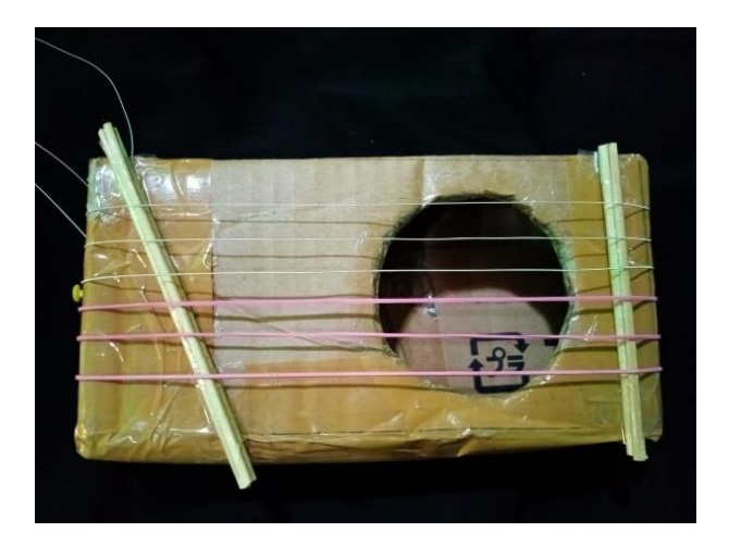
Figure 2. Examples of products that students will make

An example of the products that students may create from the STEM@Home Project on vibration, wave, and sound is shown in Figure 1. The product is a handmade guitar using the used material, such as cardboard boxes, cutters, racket strings/bracelets/hair ties, rulers, and push pins. The difference in the use of guitar strings, or rubber bands is done to find out the difference in waves and sounds produced from each object that becomes a guitar string.