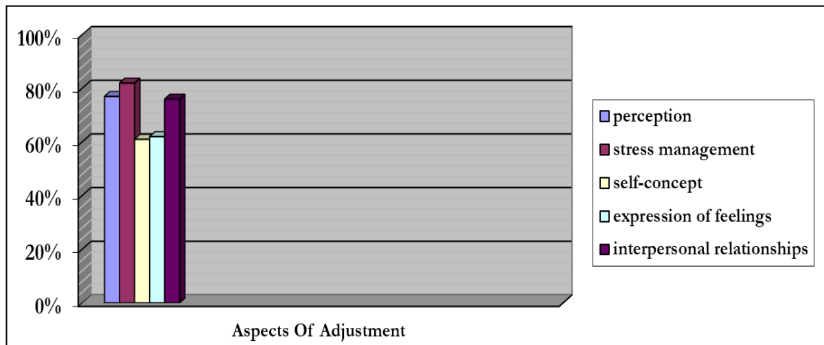
Figure 2. The Percentage of Self-adjustment Aspect

Based on the percentage of each aspect, the aspect of positive self-image (61%) was the aspect with the lowest percentage. The aspect of expressing feelings (62%) became the second lowest aspect experienced by engineering students in UNIPA Surabaya in the process of self-adjustment during the online learning. The aspect of positive self-image also affected the effectiveness of self-adjustment experienced by the individuals. This is in line with Safareka Yuliani (2017)’s statement that there is a significant relationship of self-image with the adjustment process. The higher the self-image possessed by the individual, the better the self-adjustment process. The ability in expressing feelings is needed in the adjustment process. If it is not performed properly, it can lead to imperfect self-adjustment processes. It is in line with the results of research (Nadlyfah & Kustanti, 2018) that the higher the individual's self-disclosure, the better the self-adjustment process performed by individuals, it was also said that self-disclosure makes an effective contribution in influencing the self-adjustment process.