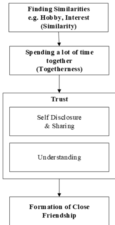
Figure 1. Formation of Friendship among Boys

As we analyze the data, we also interpret and analyse the data between boys and girls separately to reveal gender-specific dynamics. The result revealed different pattern of friendship formation between boys and girls. The dynamics of friendship formation in boys is represented in figure 1. Whereas dynamics of friendship formation in girls is represented in figure 2.