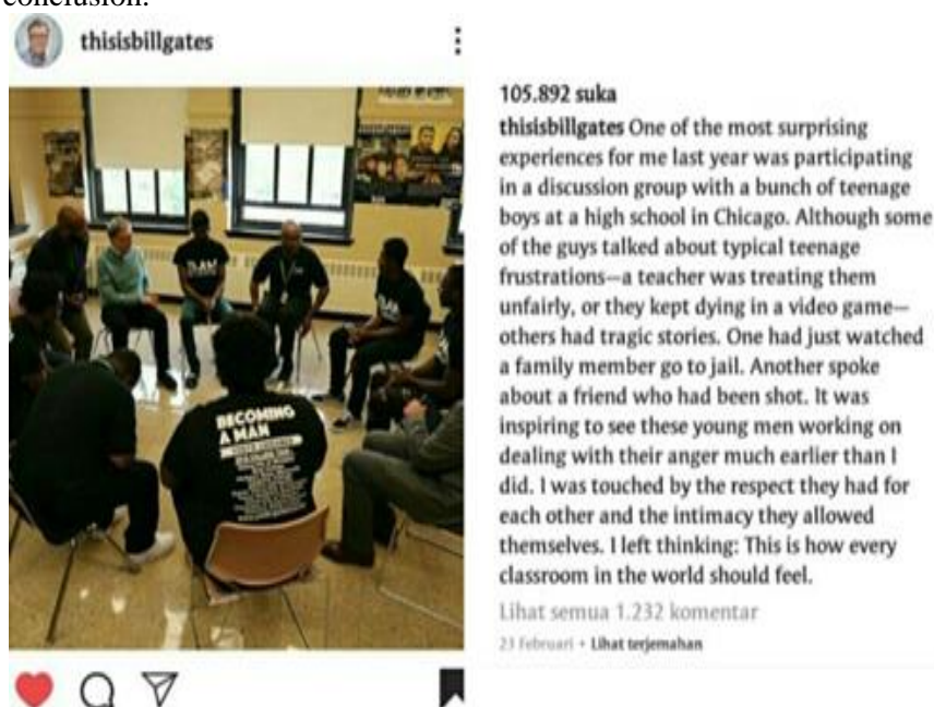
Figure 1. Bill Gates' Instagram Account

@liorskaler (4 weeks ago, 1 like) Agreed. We need discussions like these to happen frequently so people can have the support they so desperately need. (PP/24)