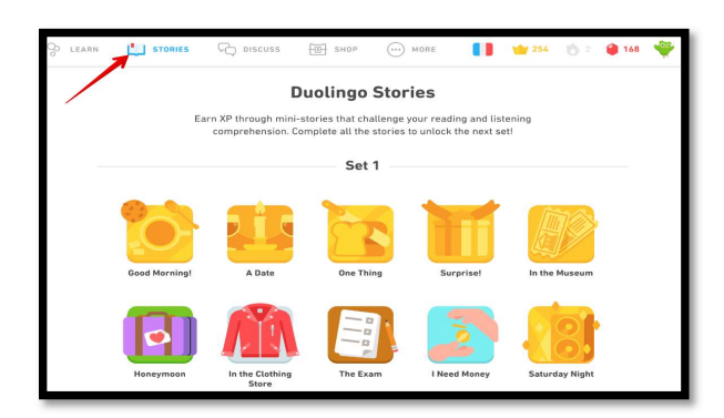
Figure 3. Duolingo stories

These are interactive stories in which learners will hear or read in their target language, then the application will ask the learners which vocabulary word is correct. The question varies, it could multiple-choice, fill in the blanks, and sentence arrangements. This feature welcomes the language learners to real scenarios where they can apply the authentic usage of their target language, as can be seen in Figure 3 below. As of now, these stories are just available in several languages – Spanish, Italian, English, Portuguese, German, and French.