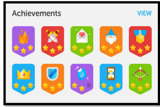
Figure 1. Achievements and badges

Achievement badges are symbolic awards given to students for completing "any type of skill, knowledge or achievement" (Abramovich, Schunn, & Higashi. 2013). In Duolingo, the application gives badges to the language learners when they cleared the levels correctly. These badges differ from colors and worth, as the language learning process increases, the learners will gain more. This feature serves as an encouragement to the language learners, they feel as if it a gift for their hard work. Similarly, Geohle (2013) reported that learners felt rewarded for completing their homework and appreciated the extra acknowledgment obtained when they were awarded a badge or an achievement. The badges and badges are depicted in Figure 1 below.