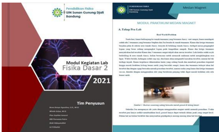
Figure 2. HOT LAB on the E-Module of basic physics 2