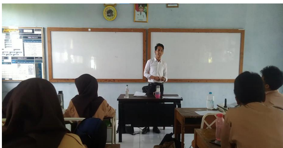
Figure 2. Review stage