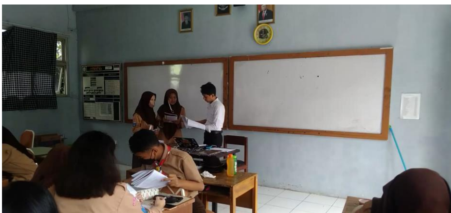
Figure 4. Cooperative work stage