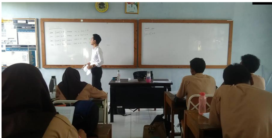
Figure 3. Development stage