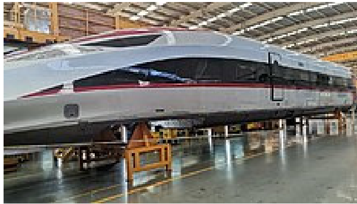
Figure 1. KCIC400AF in production at the Qingdao Sifang CRRC factory

According to Presidential Regulation No. 109 of 2020 (Kementerian Perhubungan, 2020), High Speed Rail Construction is included as a National Strategic Project. The designated route is the Jakarta–Bandung route as far as 142.3 km. The number of stations calculated referring to the China Code for Design of High-Speed Railway obtained four stations: Halim, Karawang, Walini, and Tegalluar. Each station will be equipped with facilities to support transit-oriented development (TOD) around the station. Based on cost efficiency, Walini Station will be shifted to Padalarang simultaneously for mode integration reasons. The construction of the Jakarta-Bandung high-speed rail line is designed with a maximum speed of 400 km/hour, so the components that make up this high-speed rail line are very different from existing rail lines in Indonesia ( indonesiabaik.id , 2022).