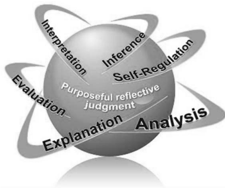
Figure 1. The Essence of Critical Thinking

decision making. It is also possible that explicit instruction in critical thinking causes students to transfer the skills taught in class into their lives. Finally, it is not known whether critical thinking affects all aspects of decision making equally or whether certain decisions (e.g. financial and health decisions) benefit more from the application of critical thinking skills than other decisions (e.g. interpersonal decisions) [10]. Cognitive skills here that become the core of critical thinking include interpretation, analysis, evaluation, conclusions, explanations, and self-regulation [11], which are shown in Figure 1.