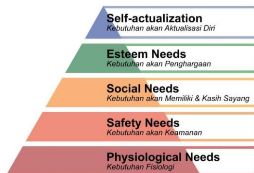
Figure 1. Maslow's Hierarchy of Needs

Maslow's hierarchy of needs theory states that human wants and desires have an impact on consumer buying decisions. People first seek higher demands such as respect and recognition before fulfilling their basic needs such as food, water, and security which can be seen in figure 1. Meanwhile, according to Kotler & Keller (2021) claims that situational, cultural, social aspects, personal, psychological, and social all have an impact on how consumers behave when making purchases. These elements interact with each other and affect the choice to buy.