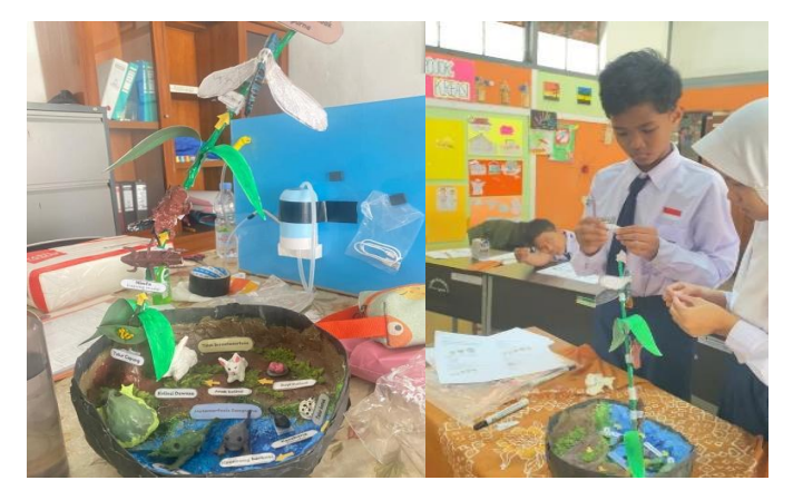
Figure 1. Ecoterm media

Terarrium is a glass or plastic container used to grow small plants or small animals in a controlled environment. Terarrium often resembles a mini ecosystem where plants or animals can grow and develop with conditions similar to their natural habitat (Manurung et al., 2023). This media is made from used gallons and contains miniatures of various animals that show their life cycle process. With an interesting visual experience, as well as the support of previously applied learning strategies, deaf learners can understand animal metamorphosis material more deeply.