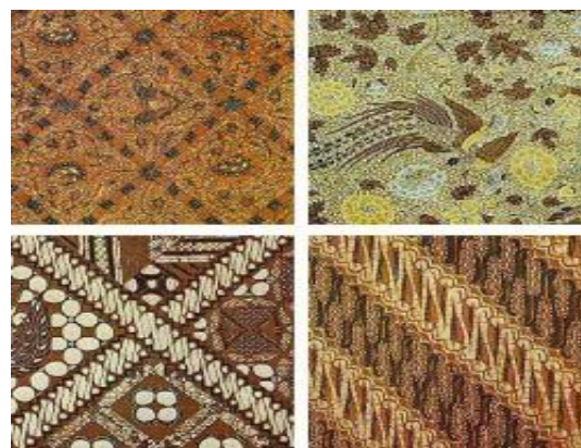
Figure 2. Modern Batik Motifs

On the other hand, Batik Saudagaran is batik consisting of motifs that can be worn by civilians and available for trading. Modern batik freely traded nowadays may be included in this type of batik. Modern batik can be seen from several points of view. First it may be considered modern batik from the sense of motif (as if making a new pattern or modifying previous traditional motifs). Second, it may be the reason from the technique it is made (modern stamp or even print). Modern batik generally has more "pop" motifs and mass-product oriented which may neglect some values in traditional batik making process.