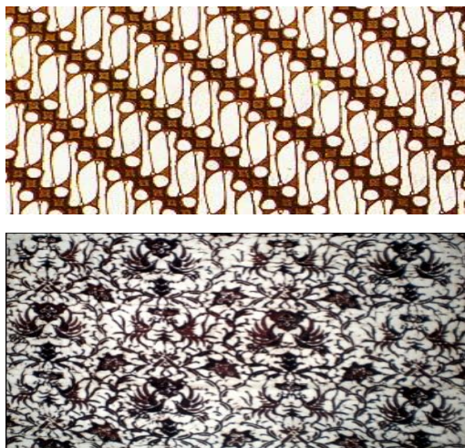
Figure 1. Parang and Sidodrajat Motifs

Talking about batik, then it will never be separated from traditional Batik which came from the old Java. Batik for the old Javanese has a communication function.