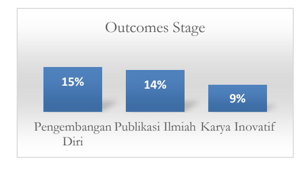
Figure 3. Outcomes (results) Stage

The results of the analysis at the transaction stage (see Figure 2) include aspects supporting the success of the CPD program, namely teacher ability and readiness, infrastructure and support for program implementation. The sub-indicator of teacher ability and readiness consists of 6 statement items in the very good category (93%), infrastructure consists of 5 statement items in the very good category (84%), and program implementation support consists of 7 statement items in the good category (75%). So, the average percentage of the three sub-indicators at the transaction stage to support program success is 84% in the very good category.