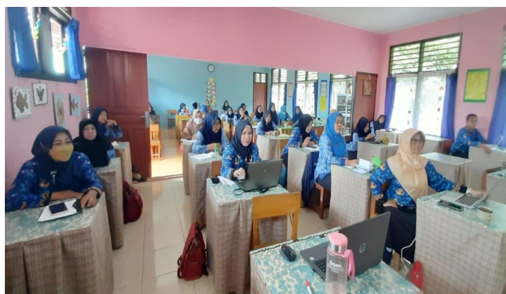
Figure 3. The Teachers Participate in the Training to Improve Their Skills

The efforts begin with quickly adapting to and accepting changes. The teachers engage in self-development through training and technical guidance, as illustrated in Figure 3. They also share their perceptions of innovative solutions for integrating ICT into learning, such as using smartphones in their schools. The statement above concludes that teachers can address problems associated with the rapid development of ICT.