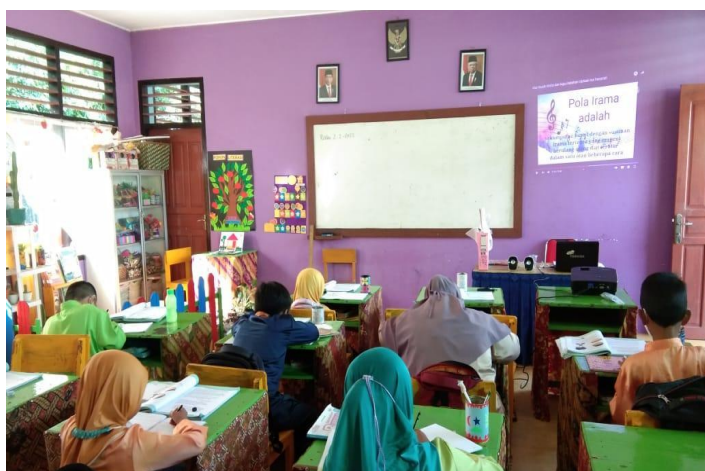
Figure 2. Learning Activities in Class Using ICT

Figure 2 shows that the teachers use ICT tools in the learning process. The tools include Infocus, laptops, and speakers. They already apply ICT learning in the class. They already know how to operate the ICT tools properly, especially for teaching and learning. It follows Aspi & Syahrani (2022), who stated that the teachers in the current ICT era must not only teach but also manage to learn. It implies they must create challenging and creative learning conditions for the students. Teachers must also motivate the students and use multimedia, multi-methods, and multi-sources to achieve learning objectives (Susanti et al., 2020).