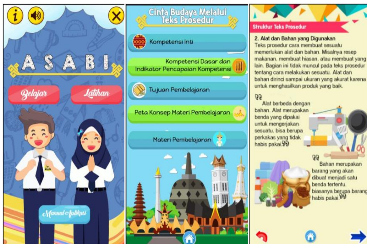
Figure 3. Application Display

This research succeeded in developing a mobile learning media in the form of an application called ASABI. ASABI is an Android-based application that functions as learning media for procedural text material in junior high schools. This application supports mobile learning-based learning but it can also be used in learning that takes place in the classroom. This application was created to provide learning media according to students' needs and circumstances when learning procedural texts. The use of this application was also expected to improve student learning outcomes. This application contains material, student activities, and evaluation questions that highlight elements of local wisdom, namely Lampung culture. Trials carried out on one teacher and 32 students indicate that this application can be used on Android devices with the Android 4.0 (Ice Cream Sandwich) to Android 11.0 (Red Velvet Cake) operating system without experiencing failure or problems. The following is a display of the ASABI application which has been tested and the results of the ASABI application trial on teachers and 32 class VII students which is depicted in Figure 3 .