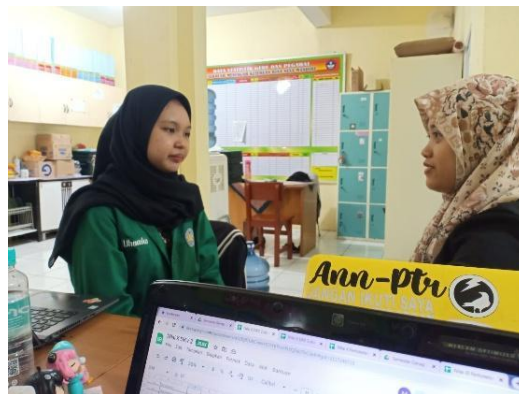
Figure 3. Interview with the teacher.

The results of interviews conducted by teachers at SMK Bina Nusa Mandiri Jakarta show in Figure 3 who have used the Canva Pendidikan Application said that many benefits are felt when using the Canva Pendidikan Application because this application for people who do not understand the world of design is beneficial because of its accessible features, the templates provided vary so that this provides convenience for teachers.