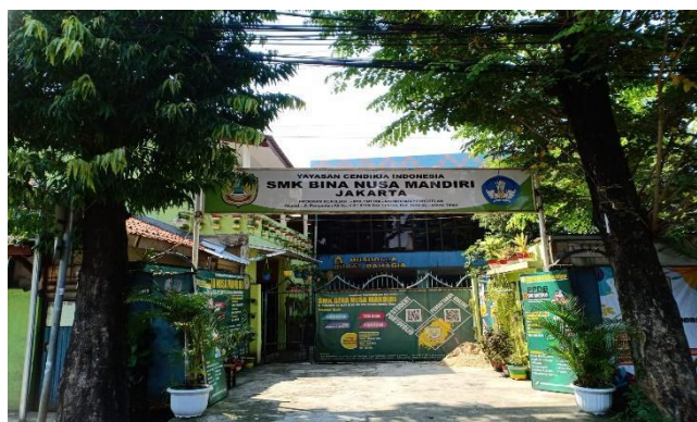
Figure 2 . School of SMK Bina Nusa Mandiri Jakarta.

Researchers conducted observations and interviews at SMK Bina Nusa Mandiri Jakarta, located on Jl. Penganten Ali No.4, Rt.01 Rw.06, Ciracas, East Jakarta. Observations were made by observing teachers in making learning media. This observation was made to find out how teachers make learning media. Interviews were conducted by collecting information related to learning media teachers use during learning. The results of observations and interviews at SMK Bina Nusa Mandiri show that eight teachers have used the Canva Application on the bell jar. Id and some teachers still have not used the Canva Application on the Belajar.id website, as shown in Figure 2 .