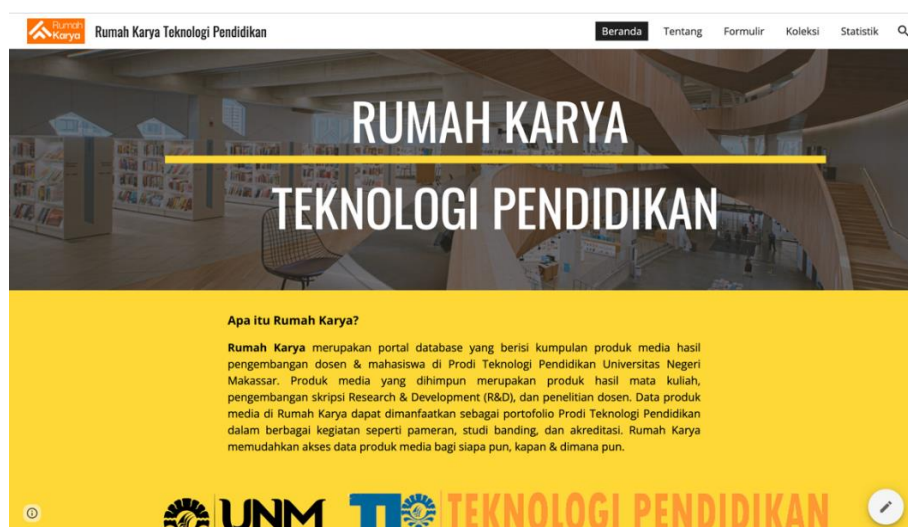
Figure 3. Display of the Rumah Karya Application Homepage

At the implementation stage, the Rumah Karya application is ready to be used by users, namely lecturers and students of the UNM Educational Technology study program. The dissemination and launching of the Rumah Karya application were carried out to make it more widely used. At this stage, the Rumah Karya application is ready to receive media data entered by users (lecturers & students) via the "Form" menu. Visitors can access media data recapitulation to the Rumah Karya application through the "Collection" and "Statistics" menus. Figure 3 to 4 show tahet The Rumah Karya application provides five main menus, namely Home, About, Forms, Collections, and Statistics.