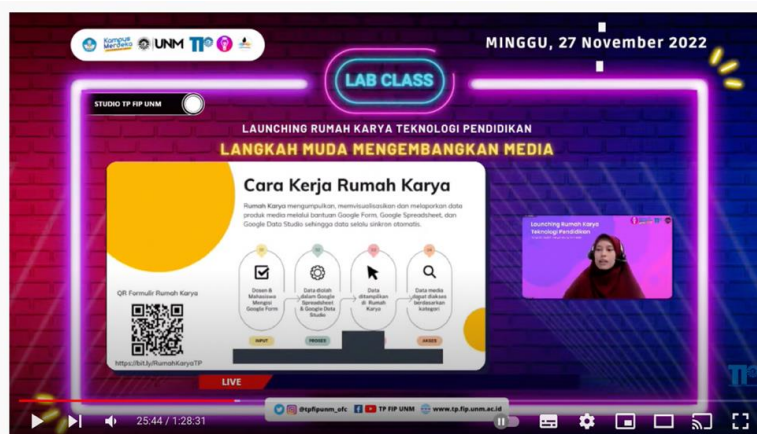
Figure 5. Rumah Karya Application Socialization Activities