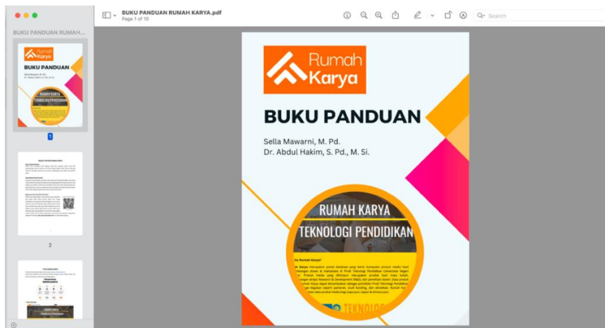
Figure 4. Rumah Karya Application Guidebook