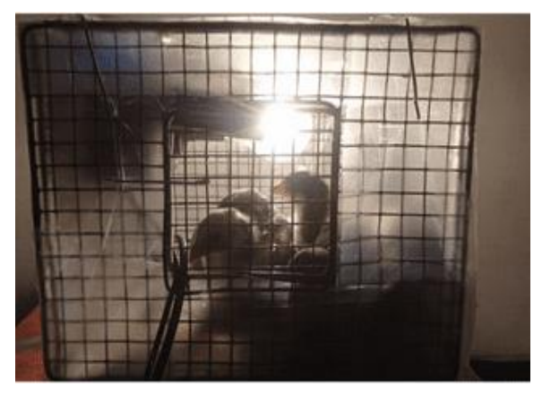
Fig 3. Display of chick temperature stabilizer incubator

Making this incubator can be made a reference for making incubators with a larger amount of capacity. However, for larger incubators, more lights and fans are also needed to optimize the work of the incubator system. For example, if the researcher wants to make an incubator for 14 chicks, feeding requires 2 lamps and 2 fans for the manufacture of the incubator. The results of the incubator design are shown in Figure 3.