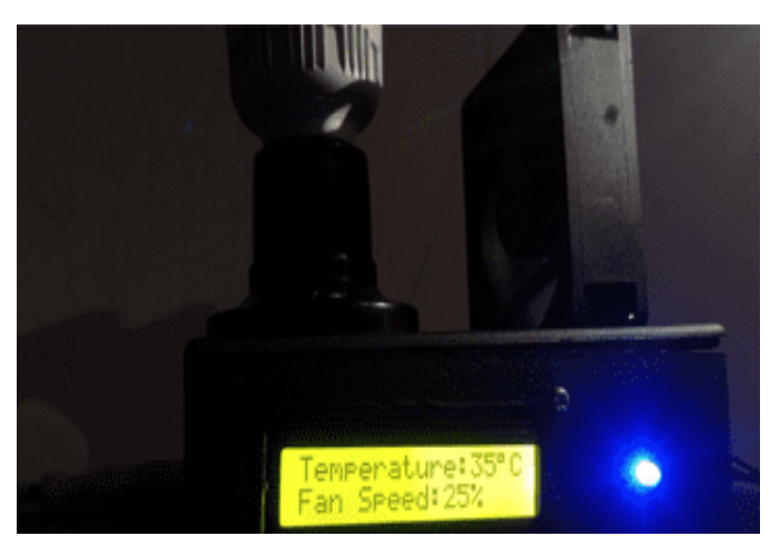
Fig 6. Temperature display 35^{\circ} C the lights go out and the fans turn on at 25% speed