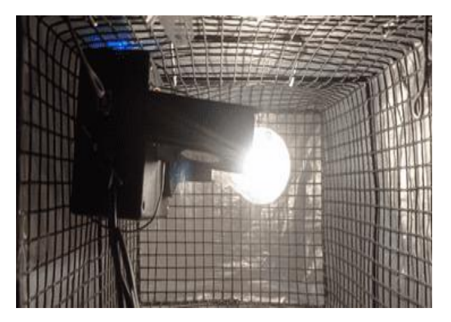
Fig 4. Display in the chick temperature stabilizer incubator