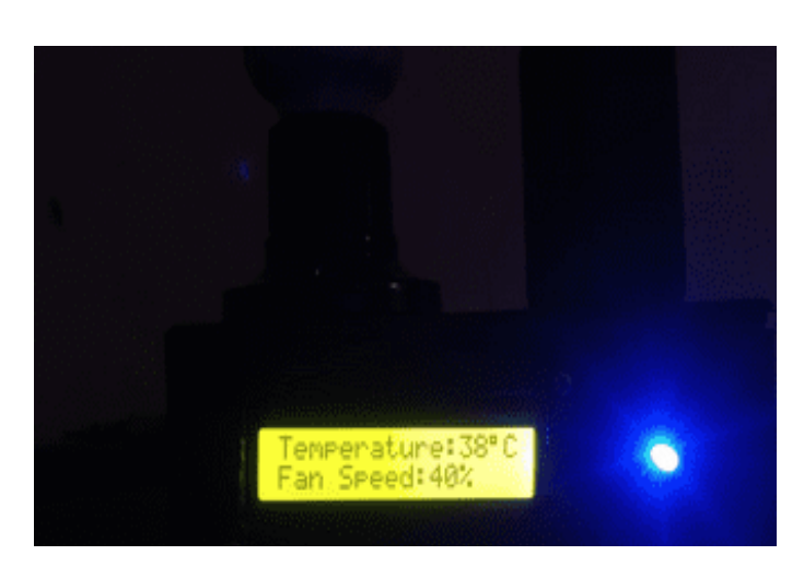
Fig 8. The temperature display is 38°C the light is off and the fan is on at 48% speed

The test results above show that the series of tools have worked according to the program where if the sensor detects a temperature above 30<sup>o</sup>C then the fan will turn on and the light will turn off otherwise if the sensor detects a temperature below 30<sup>o</sup>C then the light will turn on and the fan will turn off, the fan rotation speed also matches the temperature room detected by the LM35 sensor. Testing of this tool is carried out before the tool is put into the incubator box where the trial for room temperature regulation is assisted by matches so that the heat produced varies and the tool is effective in detecting room temperature. In this tool the direction of fan rotation can also be adjusted to the layout of the incubator so that it is effective in its use.