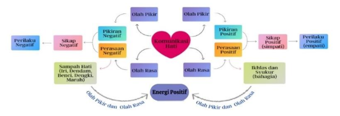
Figure 1 Heart Communication Model (Lestari, 2023)

genuine expressions of feelings, honesty, and various positive attitudes in communication. This may involve the following concepts of heart communication: (3) Dispose of heart trash, meaning that organization members must immediately get rid of negative thoughts and feelings to not disrupt the organization's flow. The result of disposing of heart trash leads to the following concept of heart communication: (4) Sympathy towards organization members and individuals involved in the organization, and (5) Empathy behavior involving sensitivity to others' feelings, as well as communication closely linked to organizational values and principles. Heart communication can result in (6) peaceful living, where comfortable organizational communication can form cohesion within the organization, and (7) happiness is the goal of everyone involved in the organization. These are some concepts of heart communication that can be used to analyze organizational communication as an effort to understand and empathize with the feelings of others inside and outside the organization (Lestari, 2023). In this context, heart communication is often associated with the formation of positive attitudes and behaviors, and its impact can create closer and more meaningful relationships in building relations within the GIM organization. This is relevant to the heart communication model illustrated in Figure 1.