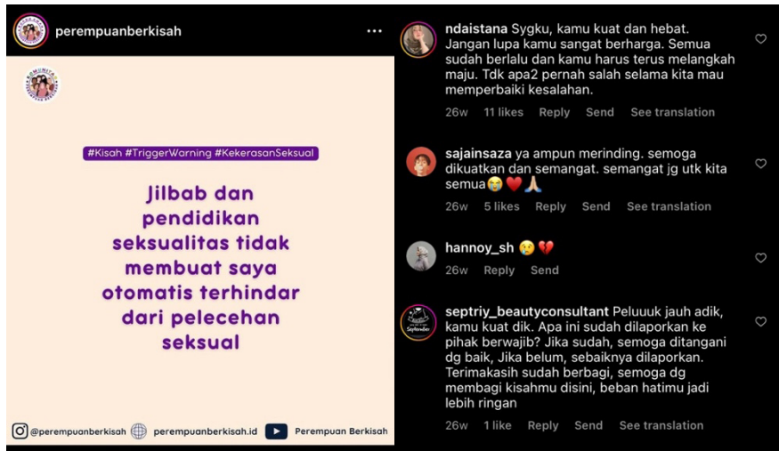
Picture 1: Instagram uploads of @perempuanberkisah and the comments column

Source: https://www.instagram.com/perempuanberkisah/?hl=e , July 27, 2022