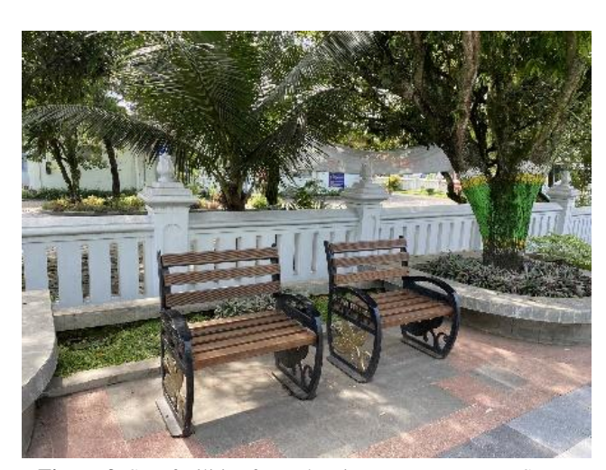
Figure 3. Seat facilities for pedestrians on Parasamnya Street

are made with dimensions as needed and use materials with high durability.