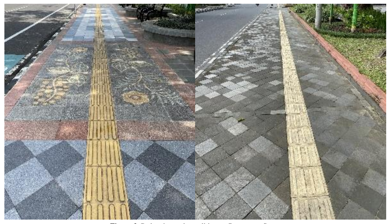
Figure 2. Pedestrian path condition on Parasamya Street