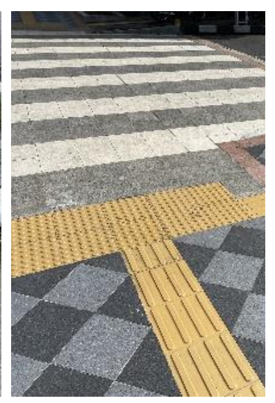
Figure 6. Facilities for the disabled on the pedestrian path of Parasamya Street

The ramp is an inclined plane that distinguishes the height of the floor surface and can facilitate movement, including on pedestrian paths. In the existing condition on Parasamya Street, ramps have been found at several main points on the east side around the government square. The condition of the ramp is very good, with a sufficient slope. However, there are still many other points of pedestrian paths on Parasamya Street that are not equipped with ramps, making it quite difficult for users with special needs, such as wheelchairs, to access the pedestrian path.