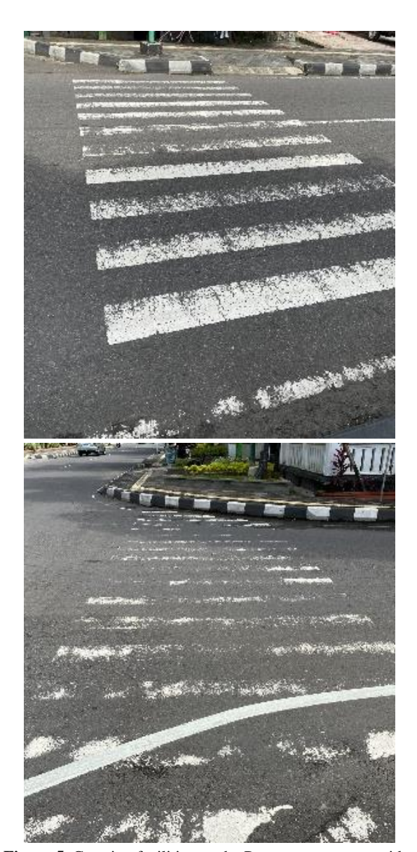
Figure 5. Crossing facilities on the Parasamya street corridor

People usually use the Zebra cross to cross from the east to the west and vice versa. Considering that this is a government area, there is also high mobility of pedestrian moving from one office building to another, so the availability of crossing facilities is certainly needed in this area. The zebra cross can be upgraded to a pelican crossing by adding a traffic signal and button for pedestrians to increase their safety.