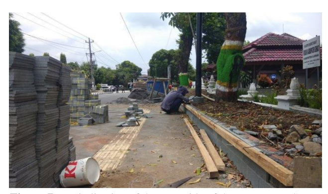
Figure 7. Revitalization of the west side of the Parasamya Street pedestrian path [19]

The pedestrian path arrangement is carried out in stages. The east side pedestrian path has already been arranged. Following the arrangement of the west side, it will be carried out in 2021. The budget for the pedestrian path on the west side comes from the Revised Regional Budget of 190 million rupiahs (see Figure 7).