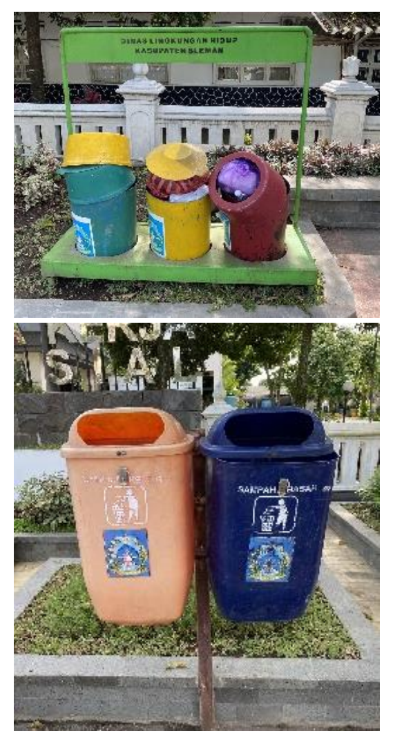
Figure 4. Trash bins on the pedestrian path of Parasamya Street