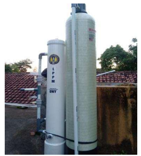
Figure 1. Series of Column Adsorption Method Water Treatment Equipment using Natural Zeolite Adsorbent and Activated Charcoal

The adsorption process in a shallow well water begins with flowing using a water pump. The a shallow well water sample containing manganese ions is passed into the first column containing natural zeolite. Water that has passed through the column containing natural zeolite is then flowed to the second column which contains activated charcoal. It then flows through a new fertilator and then exits through the faucet and is ready to be removed for analysis. The water from the adsorption results is then analyzed using an Atomic Absorption Spectrometer (AAS) which is used to determine the concentration of manganese contained in the well. Analysis of a shallow well water samples with AAS was carried out at the Water Chemistry Physics Laboratory of the Center for Environmental Health Engineering and Disease Control BBTKLPP Yogyakarta.