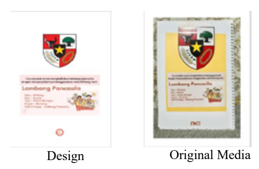
Figure 9. Page 8 Design