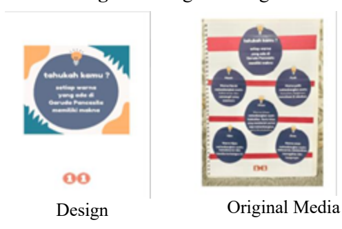
Figure 10. Page 9 Design