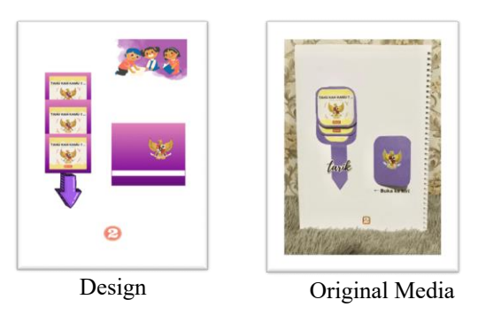
Figure 3. Page 2 Design