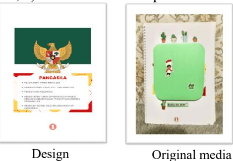
Figure 2. Page 1 Design

includes 1) Media in the form of a digital book designed with Coreldraw software, MS Office Power Point 2016 to arrange images and materials; 2) The design is arranged in Adobe Flash software to add background music, sound effects, dubbing with .mp3 extensions and videos with .mp4 extensions to make learning media more interesting; 3) After all stages are following the flowchart and storyboard, then the media can be extended .apk so that it can be operated based on android; 4) The screen display of the digital scrapbook application on the gadget can be adjusted according to the ratio on the mobile phone screen; 5) The media can be operated offline.