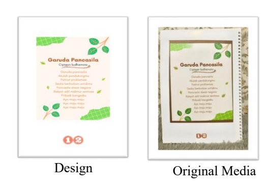
Figure 11. Page 10 Design