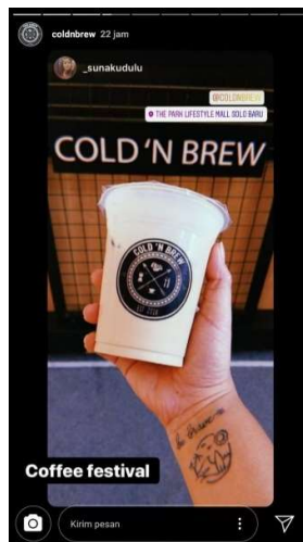
Figure 3. Screenshot from Instagram

Based on the results of the interview, in making content or post, the first thing to note is the angle or a proper angle and filters or lighting in the photo to make it look attractive. It is following the concept of using social media 4C proposed by Hauer (Solis, 2010: 263) and related to the way of interaction in it. The first is "context" how users will form interesting messages, information, or content as well as looking for exciting angles and good filters to make it more exciting and then practice in "communication" which is the practice of how users share stories or information with results The photo or video upload in Instagram or instagram-story feeds with interesting captions so that they can respond to their followers either in the form of likes or comments directly or through direct messages.