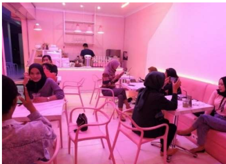
Figure 1. The Social Activity

The statement shows that eating beautiful in cafes or restaurants is becoming popular today. Where when someone visits a cafe or restaurant they will buy food or drinks that also buy the prestige values. What emerges from the beautiful eating culture, which they will later perpetuate in the social their media. So that they will get a social status that is considered high by others so that it will show their existence. According to Jalaludin Rachmat (2012, p. 38) individuals want presence not only to be considered a number but also to be taken into account or in other words not only to be considered to be present but also to be seen, therefore along with the need for individual self-esteem in search of their identity, one of them by its existence on social media. By uploading his activities on social media, he will show his existence and social status from what displays in the post, which then forms an assumption of people who see it.