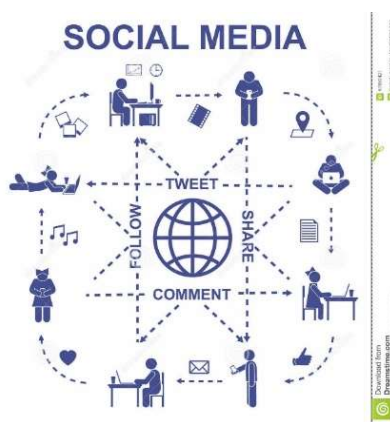
Figure 4. Concept of Social Media Communications

The picture on Figure 3 shows that the user reposting another user's Instagram story accompanied by mentioning and marking the location of the Cold Coffee Brew. It also relates to 4C that is "Connection" as maintenance of relationships that have built on social media. Informants as social media users maintain relationships with friends or followers on social media by giving likes, comments, or also responding to comments from their followers so that it can maintain good relationships and can also increase the number of followers. Communication on social media provides a pattern and a significant impact on its users. Here are the concepts and patterns of communication on the media, where users will expect the posts made to provide many responses such as likes, comments and re-posts which will be clarified in Figure 4.