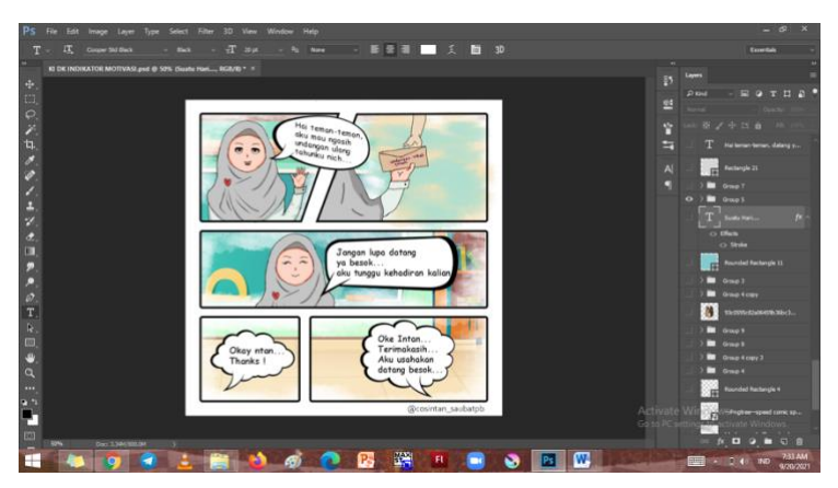
Figure 6. The finishing process of making comics using Photoshop software

Development Stage. At this stage, the design made was then created. The following is the finishing process for making comics using Photoshop software (Figure 6):