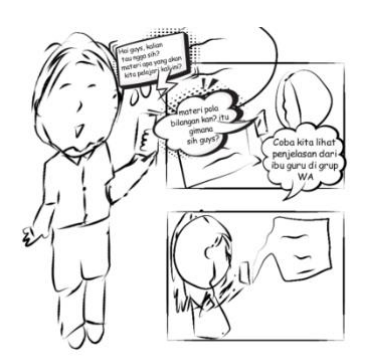
Figure 4. Storyboard