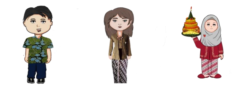
Figure 3. Plumpungan Salatiga Batik clothing design for Rico, Sinta and Intan characters

After that, the researcher developed comic story scripts along with examples of problems related to local culture (culture in Java). At this stage, the researcher developed the concept of the story along with examples of problems on paper first. The comic stories were made with the local culture theme in Java, namely about Plumpungan Salatiga Batik, Lurik Traditional Clothes, and the Tumpengan Tradition which were limited to designs, stories, and examples of questions. The design for the story concept that would be made in comics can be seen in Figure 3.