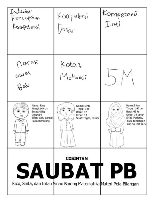
Figure 5. Instagram feed layout sketch

After developing the materials, story concepts, names, characters, and characters in the comics you have made, the next step was to create a storyboard, draw sketch to convey ideas. The results of the storyboard can be seen in Figure 4. Sketching the layout of the contents of the Instagram feed aims to create the neat posts (Figure 5).