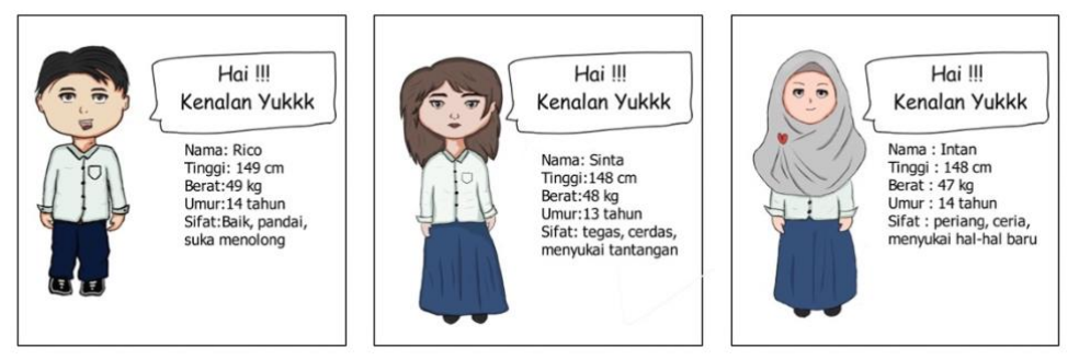
Figure 2. Designs for the names and characters of Rico, Sinta, and Intan

After that, the researcher developed comic story scripts along with examples of problems related to local culture (culture in Java). At this stage, the researcher developed the concept of the story along with examples of problems on paper first. The comic stories were made with the local culture theme in Java, namely about Plumpungan Salatiga Batik, Lurik Traditional Clothes, and the Tumpengan Tradition which were limited to designs, stories, and examples of questions. The design for the story concept that would be made in comics can be seen in Figure 3.