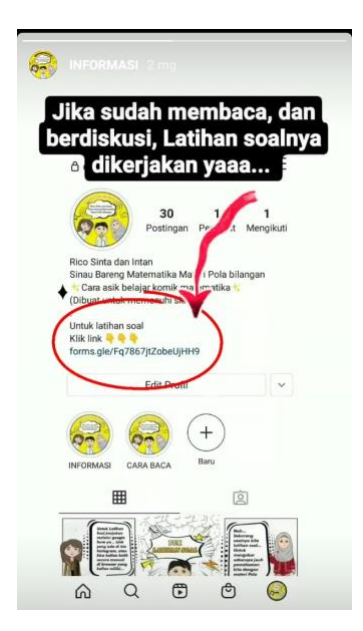
Figure 10. Google form link in Instagram Bio

Implementation Stage. At this stage, a validation test was carried out by media expert, material expert, math teacher, and a limited tryout on 27 Class VIII A students who had an Instagram account. The validation of media experts and material experts was carried out on September 7, 2021. The media expert in this study was one of the lecturers in Mathematics Education at UIN Salatiga. The results of the media validation were categorized as "Good" with a total score of 61 out of a maximum score of 75; then, the average of the total score was 4.07. The comments and suggestions provided by the media expert can become the basis for the revision.