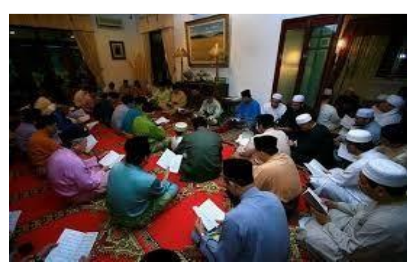
Figure 3. Ritual of Tahlilan

Tahlilan is a ritual performed by most muslims in Indonesia to commemorate and pray for people who have died. Tahlilan is usually done on the first day of death of a person until the seventh day. Then proceed to the 40<sup>th</sup> day, 100 th day and so on, even to the 1000<sup>th</sup> day of his death. Tahlilan ritual is done by reading the words of praise to God, reading the verses of the Holy Qur'an and certain prayers together (Warisno, 2017).