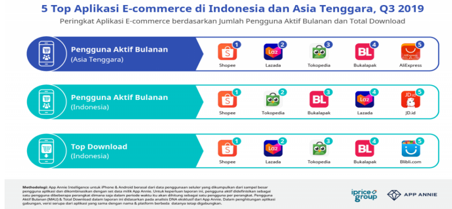
Figure1. E-commerce Competition Map in Indonesia Q3 2019