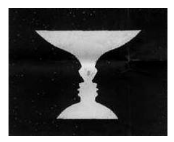
Figure 1: The Reversal of Ground and Figure

In addition, consistency of foregrounding has two aspects. By stability of semantic direction, consistency of foregrounding means that the various foregrounded patterns point toward the same