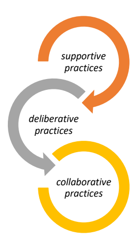
Figure 2 Civic Engagement Online Indicators

Like offline citizen engagement, online civic engagement also requires straightforward measuring tools in its activities in the digital space so that each activity can be categorized with certainty. However, it is recognized that until now, there is no established methodology to evaluate the effectiveness of online civic engagement, especially in the younger generation and other segments of the population (Raynes-Goldie & Walker, 2008). Nevertheless, several researchers have compiled a common thread for online civic engagement indicators, one of which is a study conducted by Brandtzaeg, Mensah, & Følstad, which made online civic engagement indicators include: 1) Supportive practices, namely individual participation and practice sharing online via easy-to-use social features; 2) Deliberative practices, or discursive practices, namely the process of weighing different options through discussion in which different opinions are represented; and 3) Collaborative practices, namely when youth create new ideas or solutions in collaboration to support, promote, and discuss social problems (Brandtzaeg et al., 2012, p. 65). Shown in Figure 2.