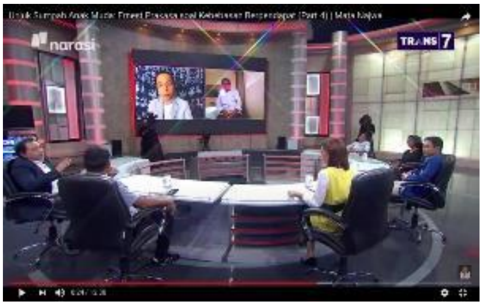
Figure 2. Student President BEM KM UNY 2020 Attended a Talkshow About Job Creation regulations at one of the national television stations.