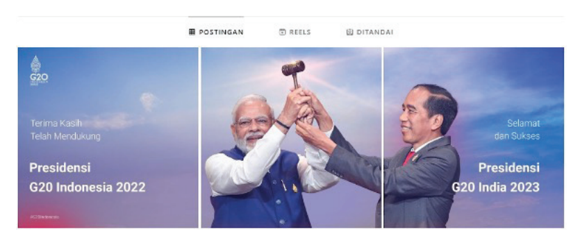
Figure 1. Posts of the Presidency of the G20 Indonesia & G20 India

The research data were in the forms of words in the comments section of the posts of three images with the same caption. In these three images, two have titles and one without a title. The first column image is entitled "Terima Kasih Telah Mendukung Presidensi G20 Indonesia 2022" which means "Thank you for supporting Indonesian G20 Presidency 2022" (source: https://www.instagram.com/p/ClkN5XAB1r4/) and the third column image is entitled "Selamat dan Sukses Presidensi G20 India 2023" which means "Congratulation and Success Indian G20 Presidency 2023" (source: https://www.instagram.com/p/ClkN1P3BtUD/). Meanwhile, the image in the second column in the middle (see Figure 1) does not have a title (source: https://www.instagram.com/p/ClkN3PoBwGq/). Below presents the data for the image post in question.