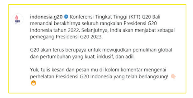
Figure 2. Caption post of Figure 1 (G20INA2020)

In this study, the post in Figure 1 was shortened to G20INA2022 post. This post was posted on November 30, 2022.